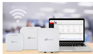
Secure Cloud Wi-Fi