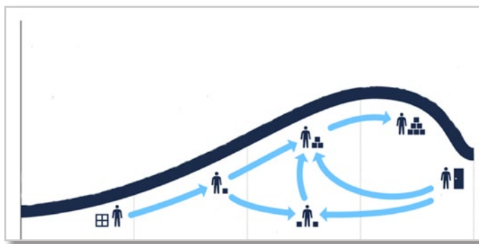
Figure 2. One-click integration with WatchGuard's FireWatch and Traffic Monitor tools

Admins can search and filter all device data to zero in on key areas of interest. They can mark devices as “known” and assign descriptive names. New, unfamiliar devices will immediately stand out when they show up without names.